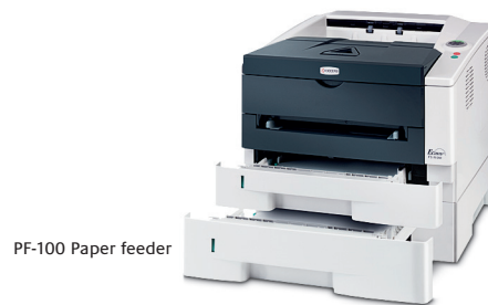
PF-100 Paper feeder

Product depicted includes optional extras